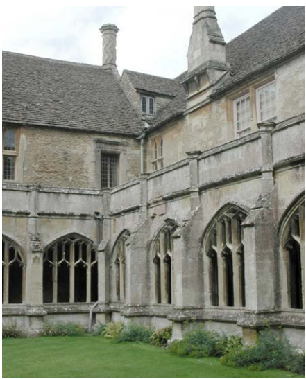
Lacock Abbey, founded by Ela of Salisbury.

Ida de Tony/Tosny, later the wife of Roger Bigod, 2nd Earl of Norfolk and Magna Carta surety.