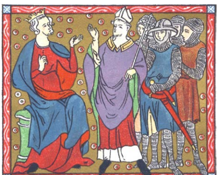
Henry II argues with Becket.

Henry II, King of England; b. 1133, acc. 1154, d. 1189. He was an energetic ruler who implemented significant legal reforms. Archbishop Thomas Becket was killed by four knights after Henry reportedly said "Will no one rid me of this meddlesome priest?"