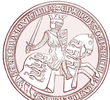
Seal of Edward I.

Edward I, King of England; b. 1239, acceded 1272, d. 1307. He was a vigorous ruler who overcame youthful arrogance and impetuosity to become an astute administrator and a great lawgiver. He set out in 1270 to join St. Louis's crusade and spent 1271-2 in Acre, to no great effect in spite of his bravery. He conquered Wales but not Scotland.