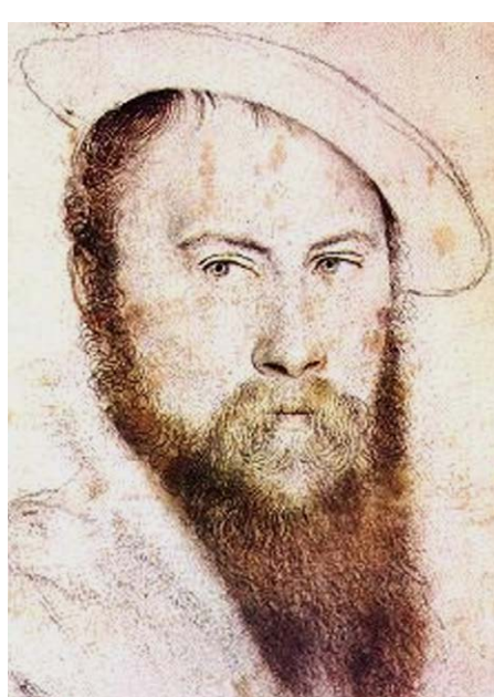
Thomas Wyatt by Holbein.